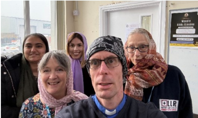
Drop in session at the Gurdwara Shri Guru Harkrishan Sahib Ji on Sunday 8th March

On Sunday 8th March I joined colleagues from the city public health team and Patient Care Locally for a drop in session at Gurdwara Shri Guru Harkrishan Sahib Ji, to understand people's questions and concerns in relation to vaccination. We held another session Wednesday 25th March with the Asian Elders group that meet at St. Paul's Church. We will be visiting Muslim School Oadby in April for a similar discussion. This is all part to work we're doing for the Preventing Health Inequalities Fund, to help colleagues to develop relationships and understanding as to why vaccination rates are lower in Oadby than the rest of the county.