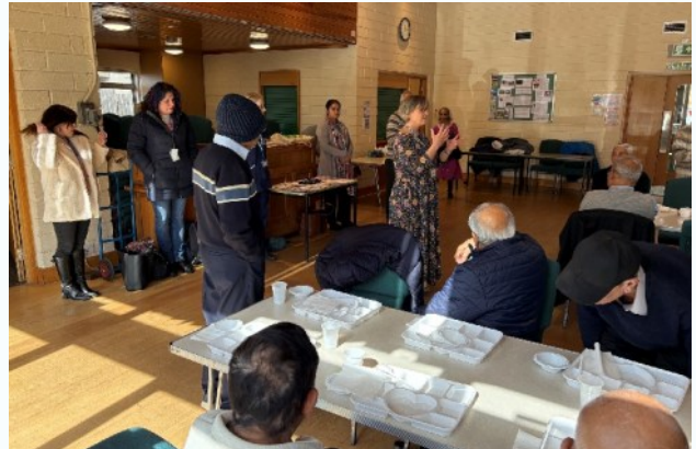
The Asian Elders Group at St Paul's Church on Wednesday 25th March